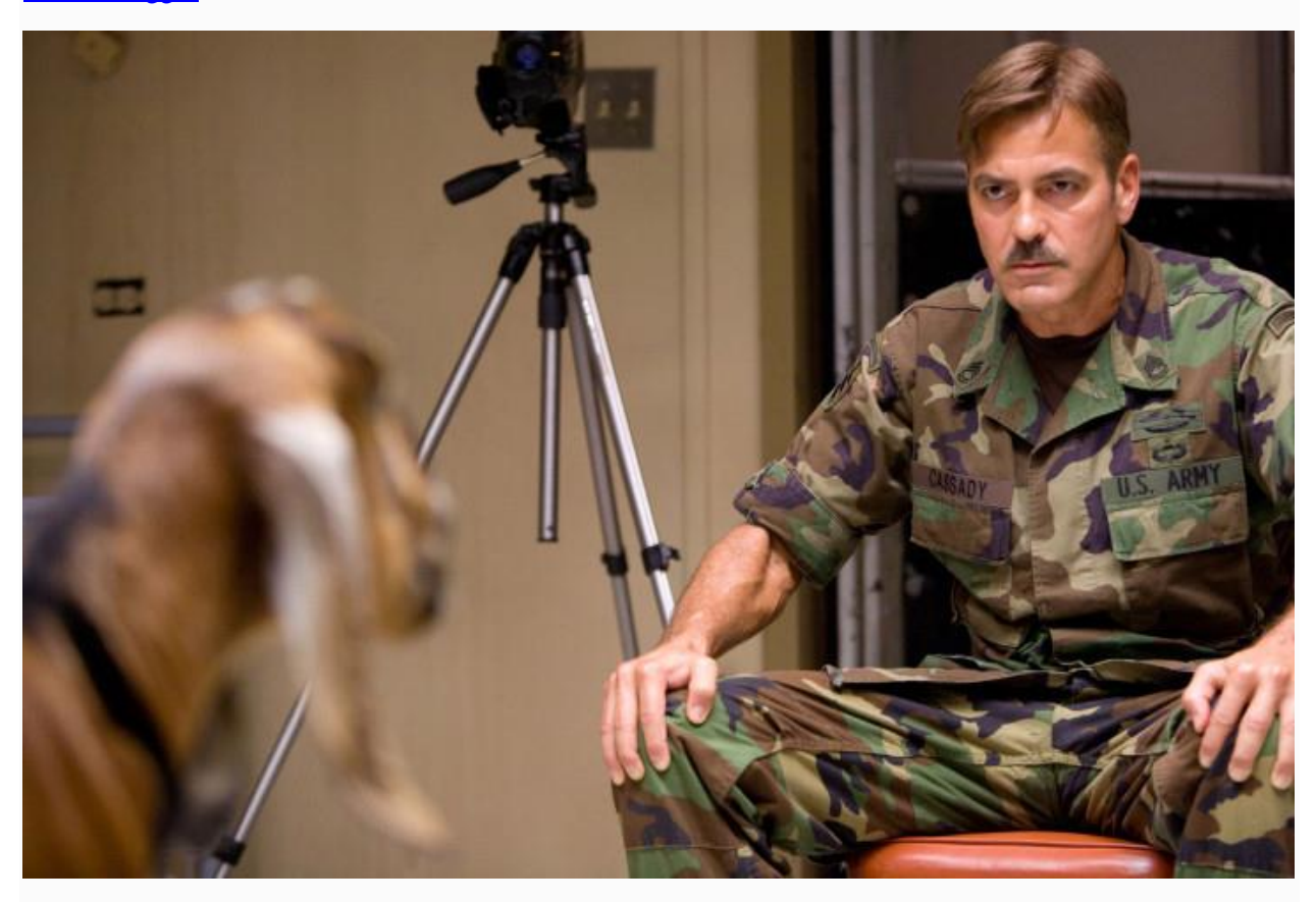
2009's "The Men Who Stare at Goats" starring George Clooney provided a farcical look at the CIA's mind-control program which was matched by the Soviet Union during the Cold War.

The race to put man on the Moon wasn't enough of a battle for the global super powers during the Cold War.